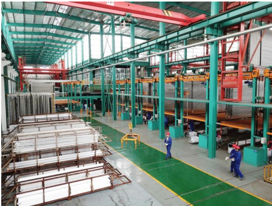
CNC Machining Work Shop :